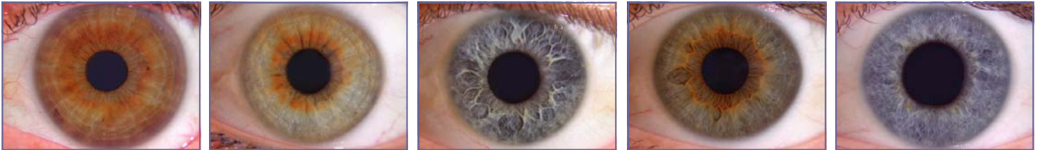
A few sample images from Constitutional Iridology