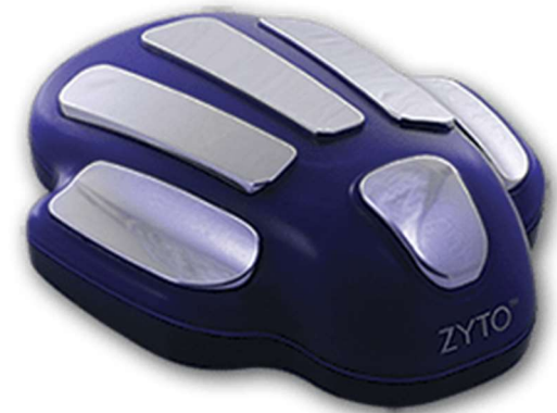
ZYTO HAND CRADLE

Just like a doctor uses a stethoscope to listen to a child's breathing, ZYTO "listens" to the body's subtle galvanic skin response using the ZYTO Hand Cradle.